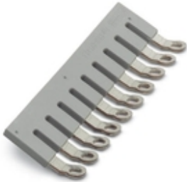
Insertion bridge, pitch: 9 mm, number of positions: 10, color: gray

Please be informed that the data shown in this PDF Document is generated from our Online Catalog. Please find the complete data in the user's documentation. Our General Terms of Use for Downloads are valid ( http://phoenixcontact.com/download )